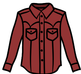
MEN'S WESTERN SHIRTS

Both traditional and modern clothing donations are appreciated and we can always use lots more men's clothing.