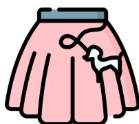
POODLE / NOVELTY SKIRTS